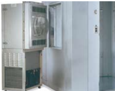
Available in both top-mount and side-mount models.