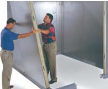
Polar-Pak® can easily be installed in practically no time at all without the services of a refrigeration technician or plumber.

Available in cooler, freezer, or combination cooler/freezer. You can choose from top or side-mount refrigeration. Floor or floorless application, indoor or outdoor, two ceiling heights (6'6" or 7'6") and standard panels allow for various layouts.